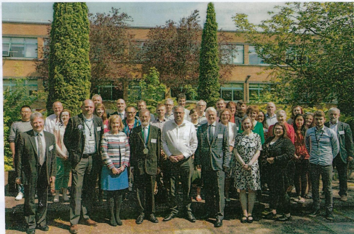
Participants enjoying the sunshine at Coffee break